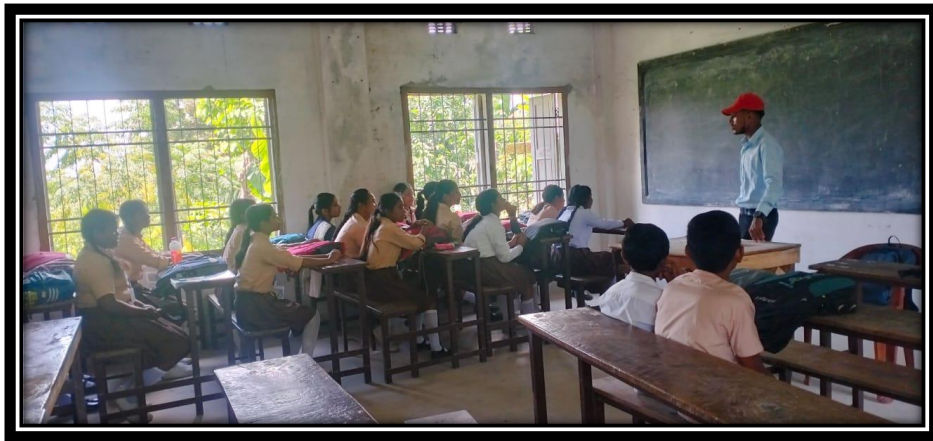
Soft skills Development program (Internet Use Advantage & Disadvantage) at Uttar Pakhuria Primary School, on Purbanchal High School, on standard-VIII Students, Rabindra Nagar Rd, Senpara, Jalpaiguri, West Bengal by M.P.Ed 2nd Year students in 2023 (Session-2022-2024)

The University of Burdwan organizes regularly events to enable the students to interact effectively and harmoniously with others and facilitate effective communication, collaboration, and problem-solving. Workshops and Capacity Building events like “Fish Breeding, Freshwater Pearl Culture”, “Fish Nutrition and Feeding Management”, “Mushroom Cultivation”, “Entrepreneurship in Agriculture and Aquaculture”, etc. , were organized to equip rural people with the soft skills like building self improvement and decision making necessary to thrive in any professional environment.