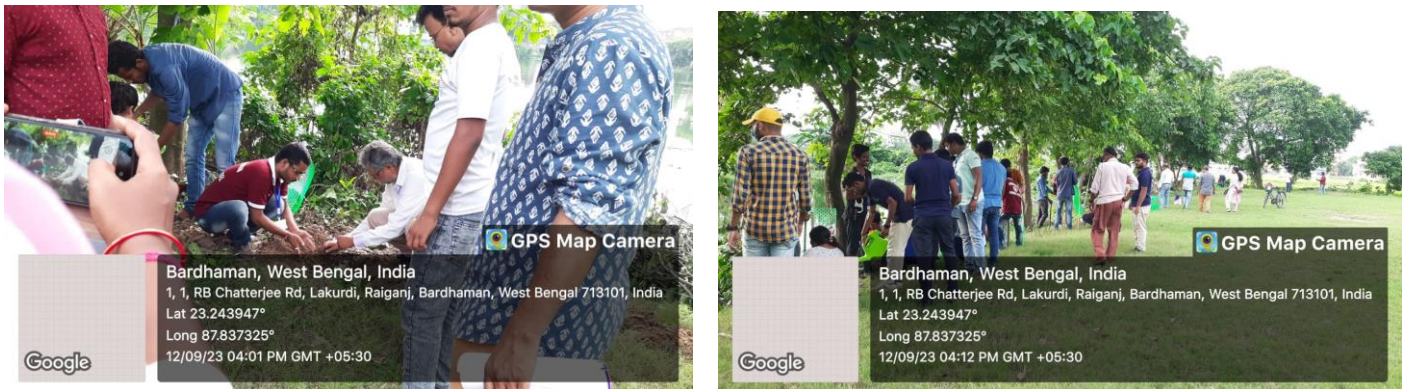
Figure 5: Picture of Tree Plantation

Then our volunteers planted several plants around the area and put fence. Then Vice chancellor Sir distributed medicines among the needy people for whom medicines were prescribed by doctor in past day. He also distributed Neem oil among many people to prevent mosquito attack.