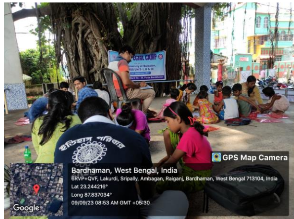
Figure 3: Free Coaching picture of Day 2 ( 9.09.2023)