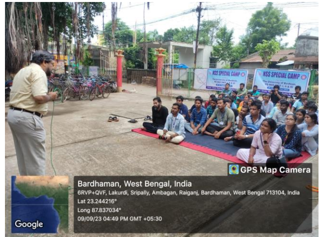
Figure 4: ‘Environment awareness and sustainability’ programme by Prof. Apurba Ratan