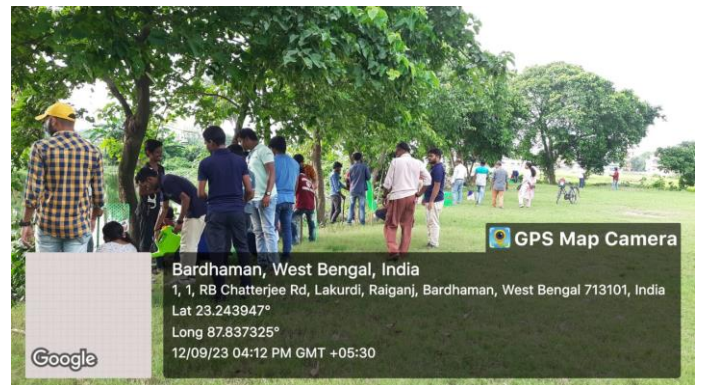
Figure 5: Picture of Tree Plantation ( Day 5, 12.09.2023)