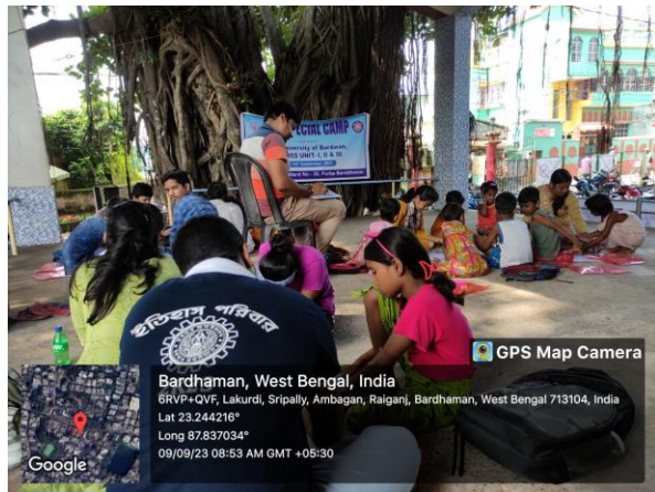
Figure 3: Free Coaching Picture of Day 2 (9.09.2023)