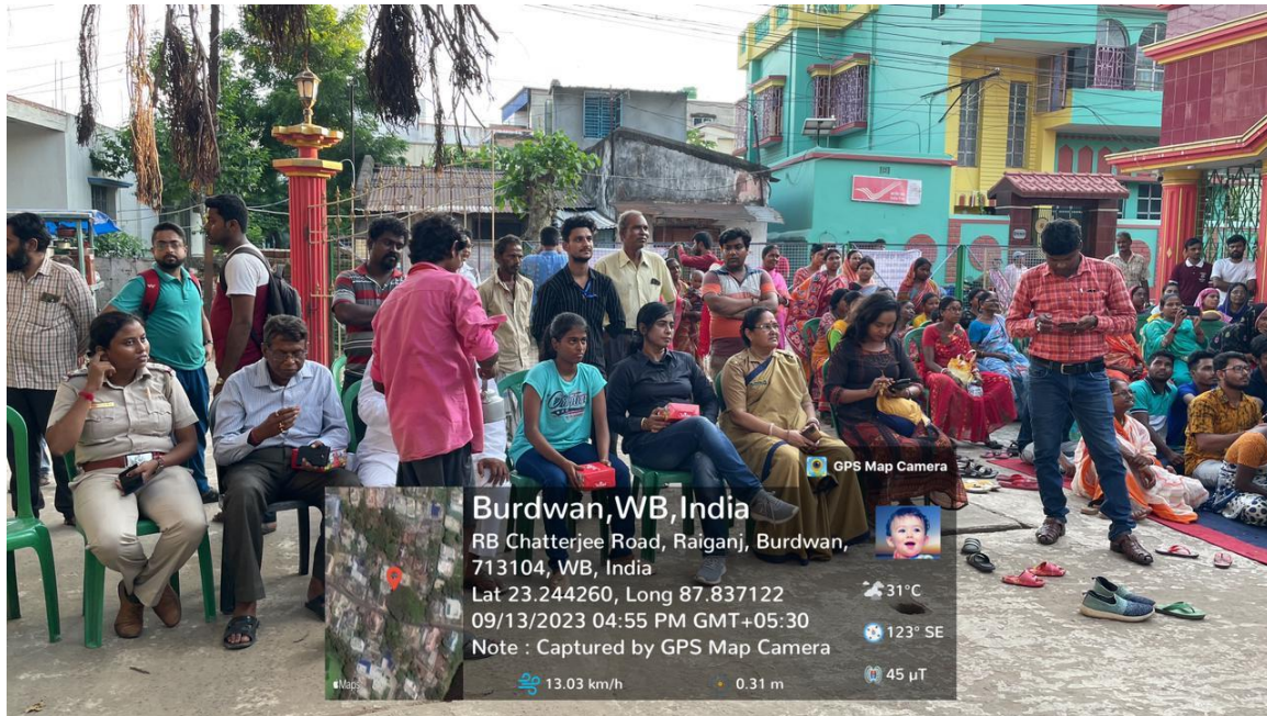
Figure 7: Picture of the Burdwan Child right Team and Purba Barddhaman Women Police group. (Day 6, 13.09.2023)