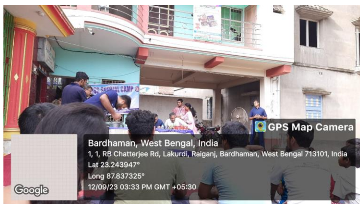
Figure 6: Picture of Neem oil distribution by Honorable VC Sir (Day 5, 12.09.2023)