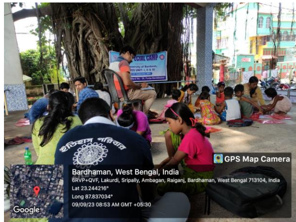
Figure 3: Free Coaching Picture of Day 2 (9.09.2023)