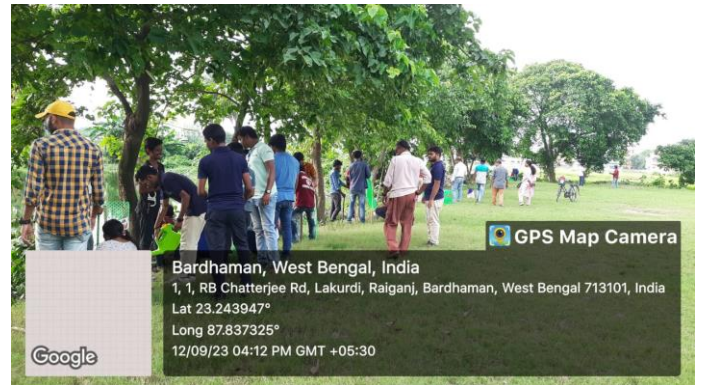
Figure 5: Picture of Tree Plantation ( Day 5, 12.09.2023)